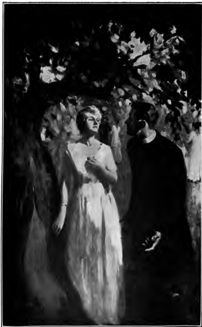
Her face, upturned to his in the moonlight, wore the austere loveliness of a saint's